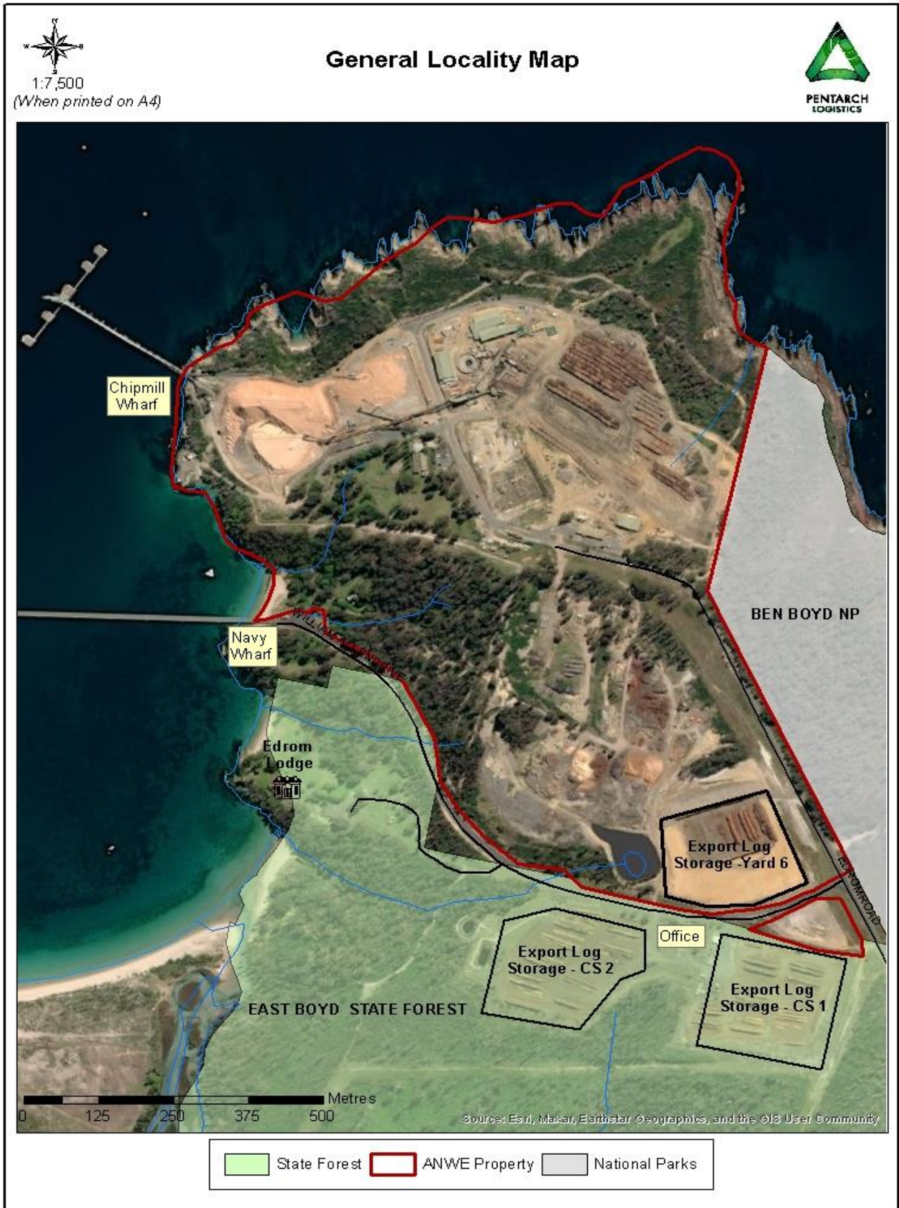
Figure 1: General Locality Map showing tenure of neighbouring land